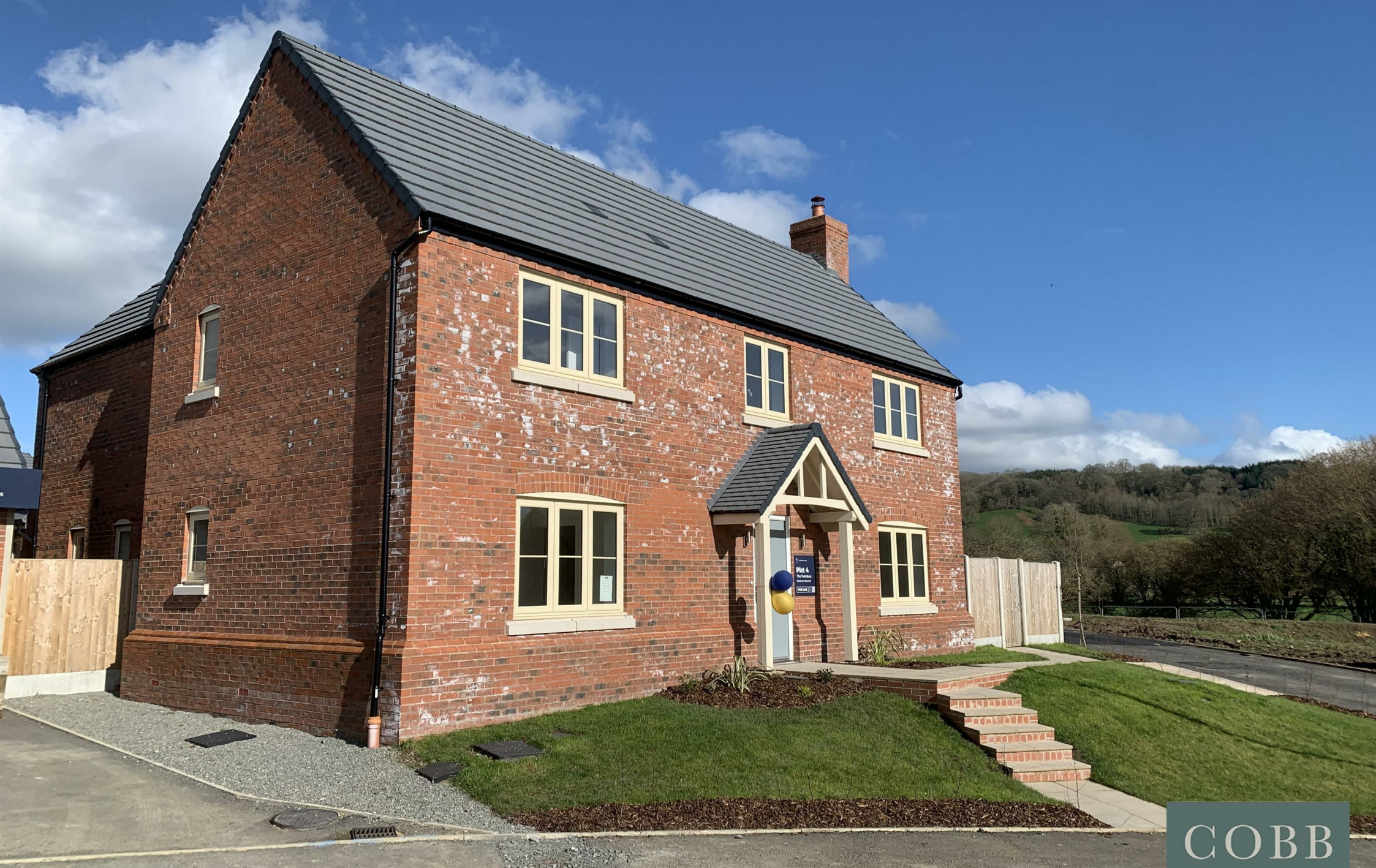
The Thornbury, Florence Fields, Leintwardine, SY7 0DF Guide Price £594,995